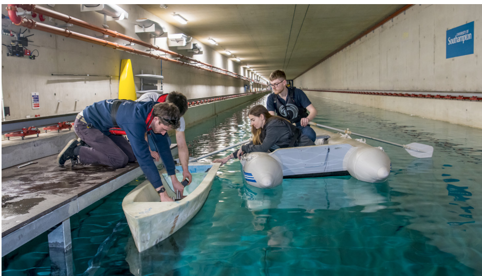
Above: 138m towing tank: Hydraulics Laboratory, Boldrewood Campus

Overall, it is home to over 4,400 undergraduate students, over 600 postgraduate taught students, 870 postgraduate research students and over 900 education, research and enterprise staff. This represents an annual research income of around £55 million.