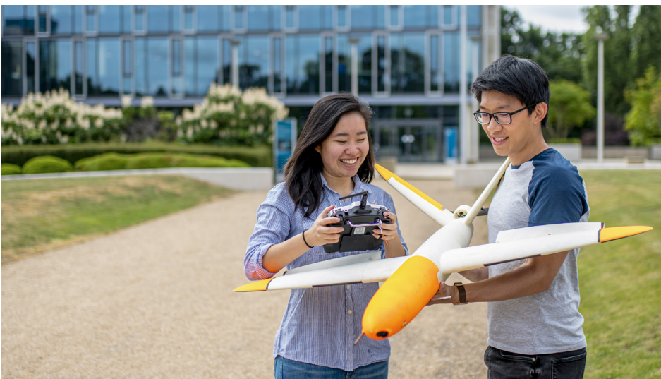
Above: Engineering students at Boldrewood Campus

Our involvement in the Athena SWAN project aims to tackle an uneven representation of women in science and as a result achieve a significant increase in the number of women recruited to top posts.